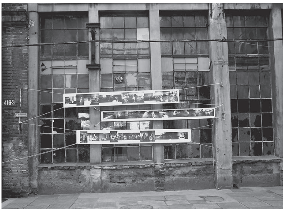
Fig. 6. Window bars used as an exhibition element, building façade of ready material warehouse in the territory of Factory of Art. Photo by M. Rusnak, 2010

authorized in the middle of 2009 by the District Monument Restorer in Łódź 12 . The realization of the first part of the construction design referring to the development and changes in the way of usage of three warehouses is supposed to be started in 2011. The completion of the re-