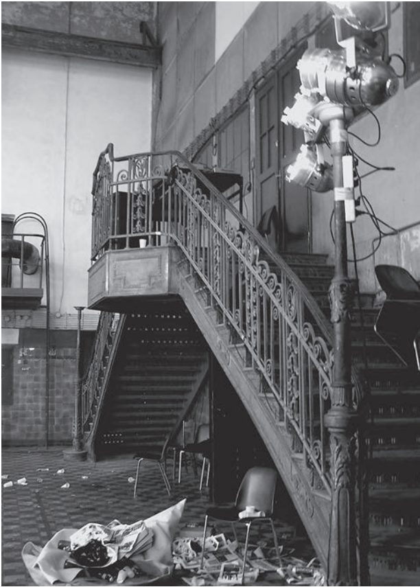
Fig. 7. Free way of utilisation of the historical power station in the territory of Art Centre. Photo by M. Rusnak, 2010