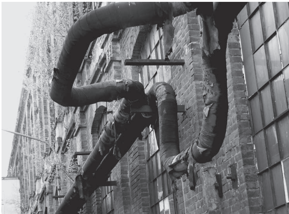
Fig. 5. Façade detail showing the present condition of buildings in Sheibler complex. Photo by M. Rusnak, 2010