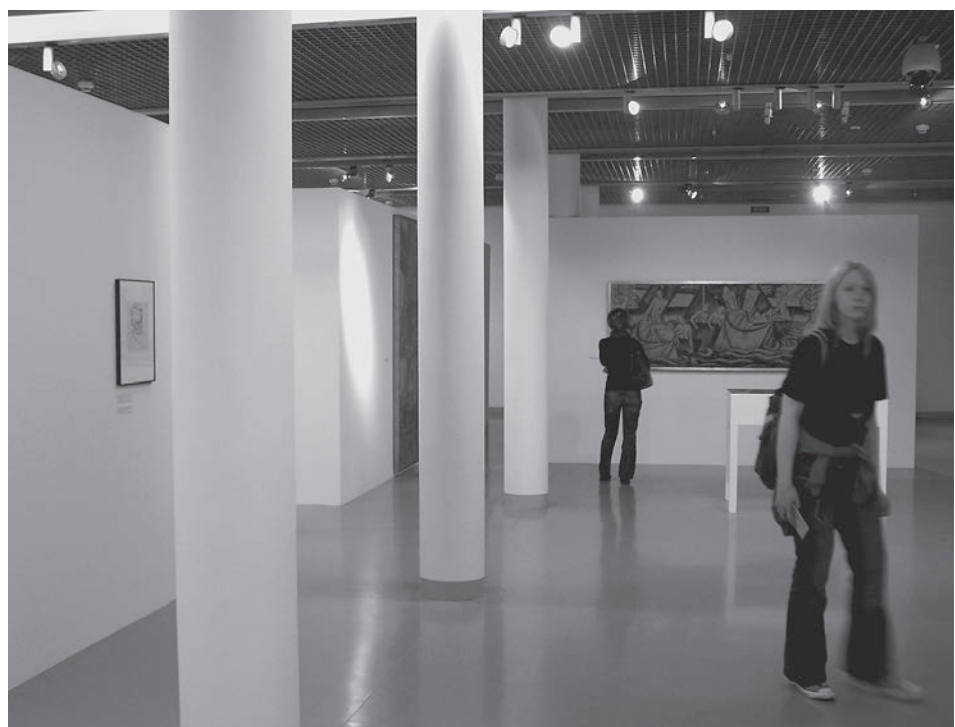
Fig. 1. Neutral interior MS2 of Museum of Modern Art department at Ogrodowa Street. Photo by M. Rusnak, 2010