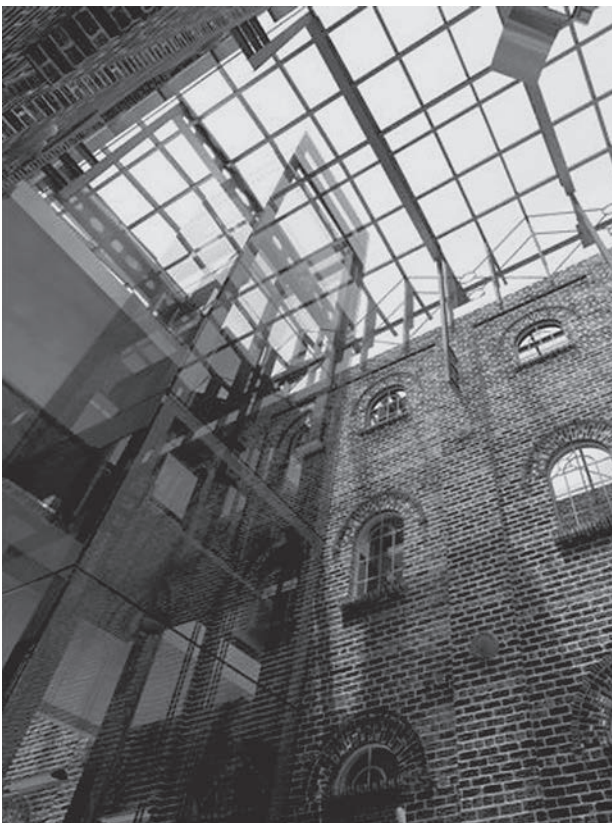
Fig. 9. Visualization of the adaptation design for the needs of Art_Inkubator. The investor Factory of Art made the photo available to the author in August 2010

the building law. Rebuilt monumental buildings are supposed to become the seat of Art_Incubator organization. The new entity is to support activities of young artists and a creative sector of Łódź economy [9].