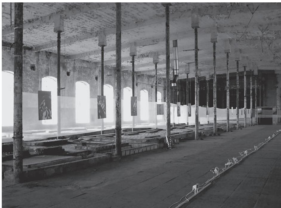
Fig. 3. Production hall interior at Tymieniecki Street during preparations of Katarzyna Czarnecka and Magdalena Olek photo exhibition. 2010