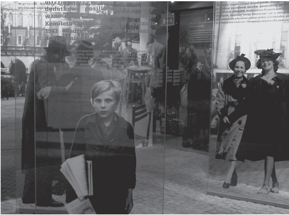
Fig. 2. Fragment of exhibition in Oskar Schindler Factory in the department of Cracow Museum of History. Exhibition scenario is constructed with the use of the multi-media presentations and many other viewer-attracting details. Photo by M. Rusnak, 2010