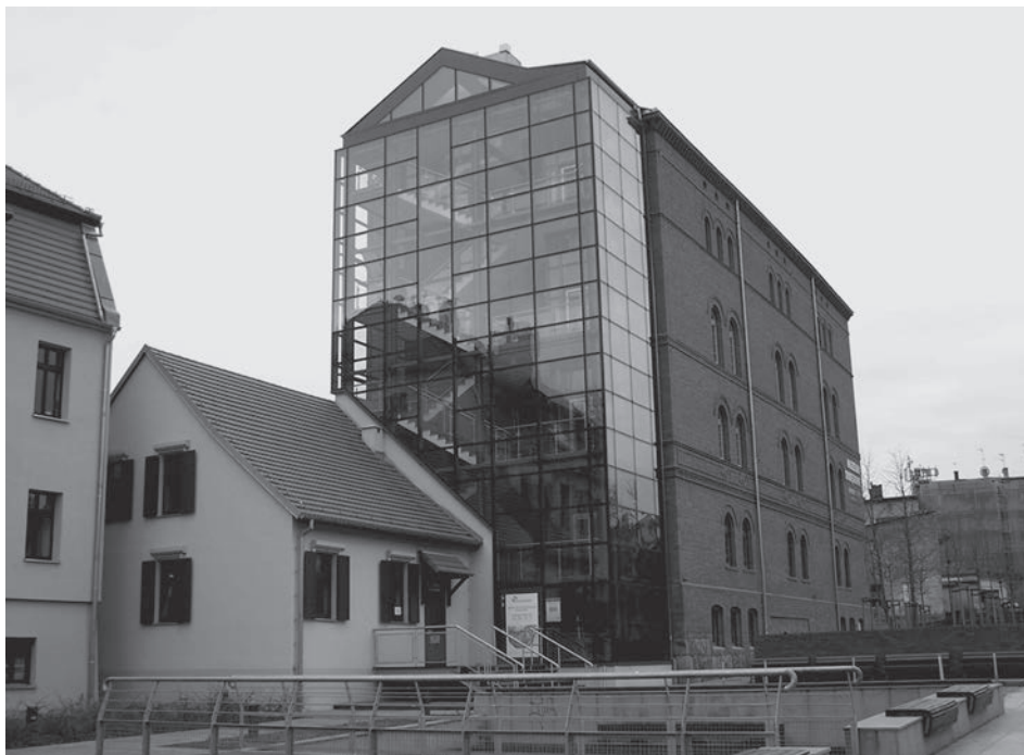
Fig. 10. New cubature view with a staircase and person elevator added to the old steam mill on Mill Island in Bydgoszcz.

tic Property Trust Optima) which now has over 50 hectares of the post-shipyard terrains – used the artists as a social group being able to improve and propagate a new usage of the place. This group activity created the basis for giving the elaborated design ‘Young City’ 13 a fashionable status of cultural revitalization. The initial purpose of reviving the old docks was the change of the manner in which this area was perceived by Tri-city residents. ‘Colony of Artists’ (this phenomenon was that name) was the first design in Poland, which was fully financed by the independent creative circles of Gdańsk. The activity of a big group of artists 14 was so influential that within only five years of activities the shipyard acquired the status of a significant place of art.