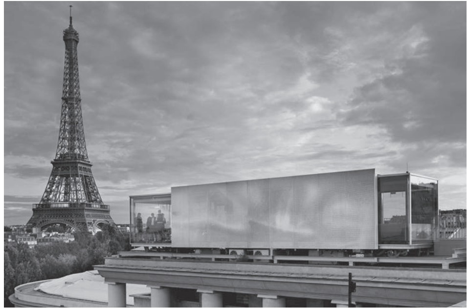
Fig. 6. Nomiya Temporary Rooftop Restaurant in Paris – Pascal Grasso.

extraordinary experiences. The potential of mobile exclusive services is shown by Parisian architect Pascal Grasso who has installed a temporary, transportable Nomiya Restaurant (Fig. 6) on the roof of Le Palais de Tokyo museum. But then again The Prefab Parasite, designed by Australia-based Lara Calder Architects reveals the possibilities of reusing exist-