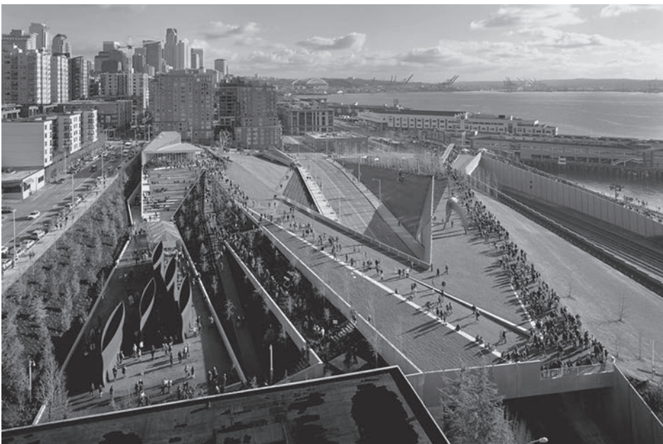
Fig. 5. Olympic Sculpture Park in Seattle – Weiss/Manfredi Architects.

Another kind of relation between architecture and intense urban fabric could be a parasitic relationship. As more and more people filter into the city, open land to build on will become more and more scarce, and we may have to use every available bit of space we can, including empty bare walls, bridge pylons, and retaining walls. In this context, parasite developments – nowadays still considered only