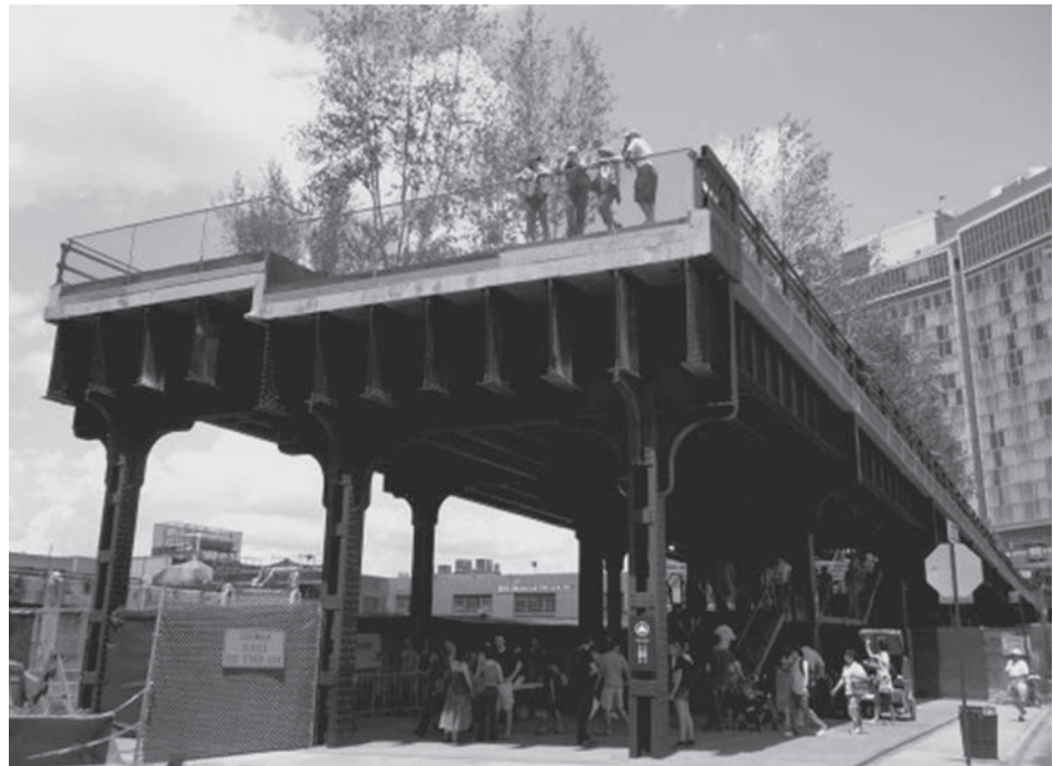
Fig. 3. The High Line in New York City – Field Operations and Diller, Scofidio & Renfro.