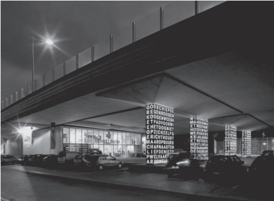
Fig. 2. A8ernA in Koog aan de Zaan – NL Architects.

Part of our public domain has been already overtaken by heavy traffic but it still can be given back. Even busy streets – treated as an opportunity, instead of as a disaster – could become a friendly environment to accommodate a new type of urban life.