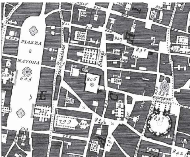
Fig. 1. The 1748 Nolli ichnographic plan of Rome – Giambattista Nolli

Mobility and high-car dependence are signs of modern life style. As a result car traffic takes over the city. Streets and many old squares, which in the past were part of public realm, became just necessary links to get from point A to point B. Street is no more public as it is used mostly by cars instead of people. In a well-known Nolli plan of Rome from 1748 (Fig. 1), private spaces such as dwellings are rendered as black solids and public spaces such as streets and squares or church interiors as white. If we would draw Nolli plan of contemporary Rome, there would be a lot fewer white voids than before – the heavy-traffic streets would have to be rendered as solid blocks. Part of public realm was taken.