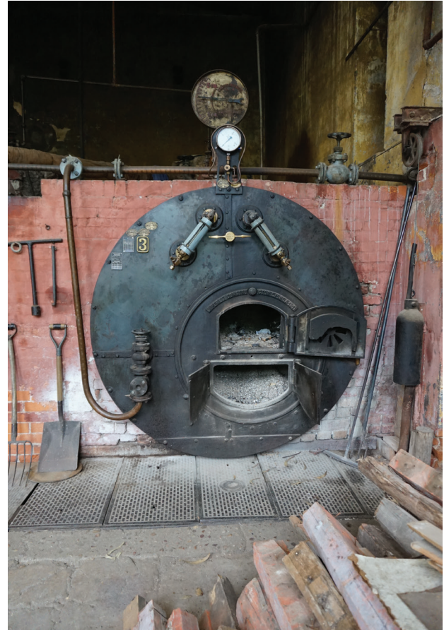
Fig. 5. Vale de Milhaços Gunpowder Factory, the João Peres brand steam generator

Within the scope of renewing the licensing processes, a record of the knowledge held by former operators and employees was set down and then deepened through bibliographic research carried out by the Ecomuseum's science team. This technical and functional characterisation of the thermal and mechanical energy generation system describes both the maintenance and conservation actions and the technical practices and knowledge for safeguarding. This methodology rests on respect for the procedures that ensure the integrity, authenticity and lon-