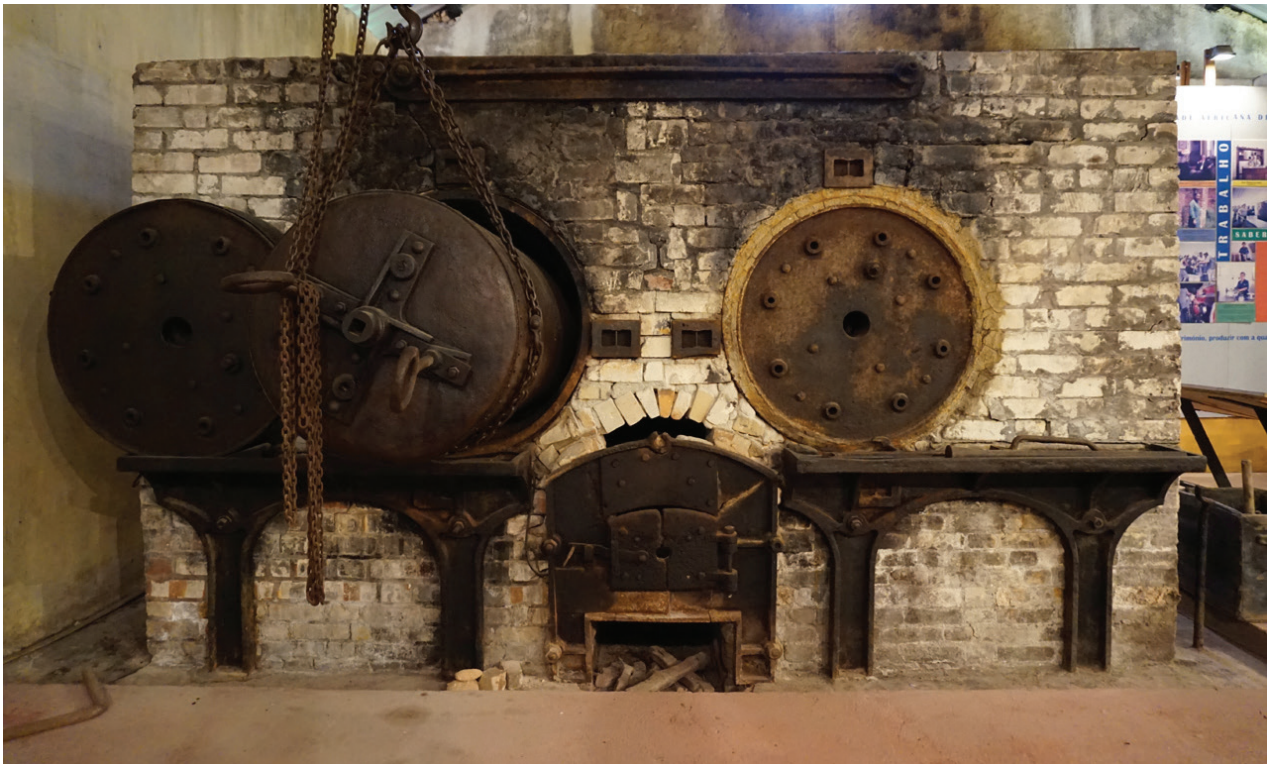
Fig. 4. Vale de Milhaços Gunpowder Factory, the carbonization workshop

Furthermore, during the industrial period, deactivating the carbonization workshop involved the deployment of an in situ heritage conservation program in conjunction with the functional reconstitution of the carbonization furnaces (Fig. 4).