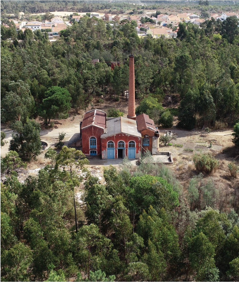
Fig. 1. Vale de Milhaços Gunpowder Factory, aerial view (© Municipal Ecomuseum of Seixal – Documentation and Information Centre and Rui Dias, 2018)

Il. 1. Fabryka prochu Vale de Milhaços, widok z lotu ptaka (© Municipal Ecomuseum of Seixal – Documentation and Information Centre and Rui Dias, 2018)