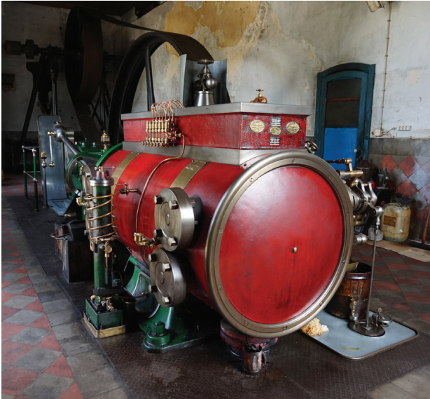
Fig. 6. Vale de Milhaços Gunpowder Factory. The Joseph Farcot brand steam engine (© Municipal Ecomuseum of Seixal – Documentation and Information Centre) Il. 6. Fabryka prochu Vale de Milhaços, silnik parowy marki Joseph Farcot (© Municipal Ecomuseum of Seixal – Documentation and Information Centre)

Among the respective boiler maintenance procedures are the water treatment operations and the cleaning of both the boiler and the chimney.