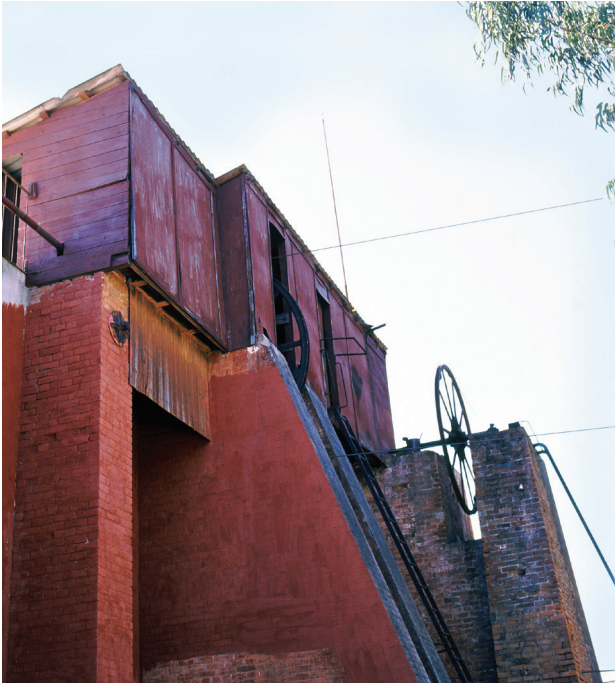
Fig. 3. Vale de Milhaços Gunpowder Factory, the transmission of mechanical energy by the system of teledynamic cables